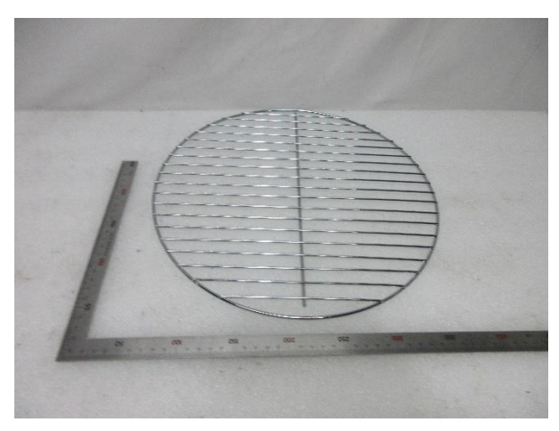
Sample No. 1