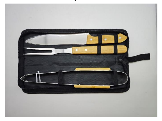
Product (Photo provided by client, for reference only)